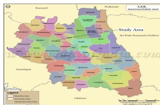
Figure-2: Study area –Yerraguntla