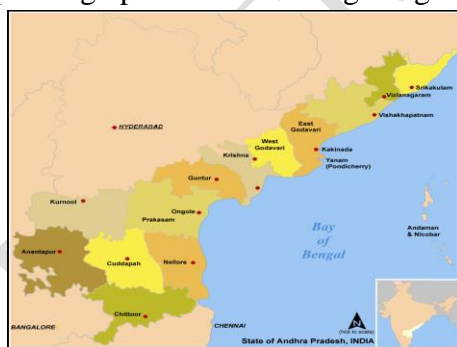
Figure- 1: Andhra Pradesh

Yerraguntla Municipal Town in YSR Kadapa district (Figure-2) is located in Andhra Pradesh (Figure-1). The area is located at 14.6333N and 78.5333E coordinates with an elevation of 152 meters. This is dominantly an arenaceous consisting of conglomerate quartzite, Quartzite with shale formation of dolomitic lime stones. The main factors that control the quality of water are associated with lithology and soil. Water quality may vary depending upon variations in geological formations